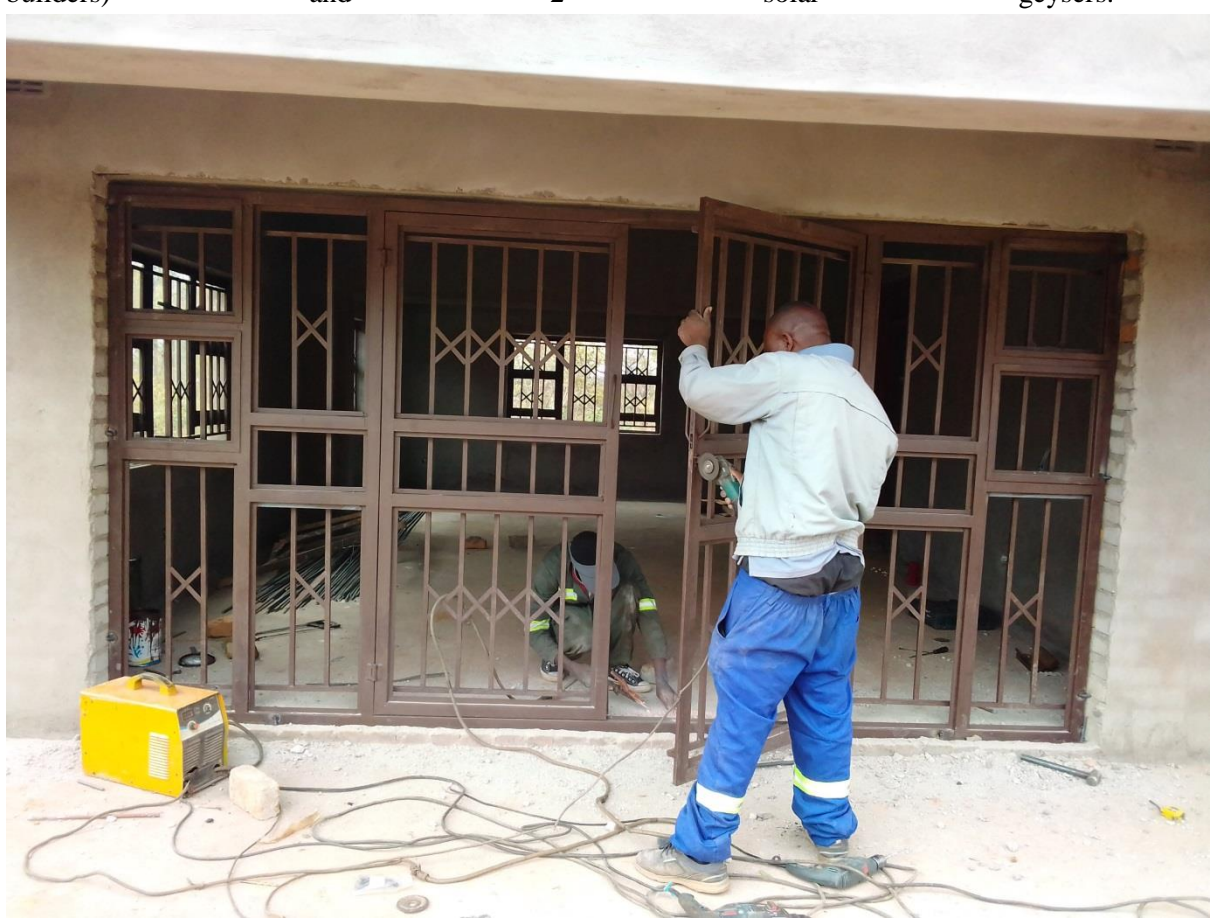
The outstanding 4m door was made successfully and fixed to the structure