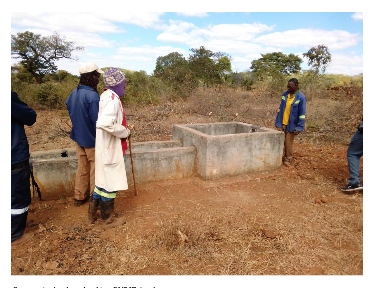
Community leaders thanking BVBIZ for the water