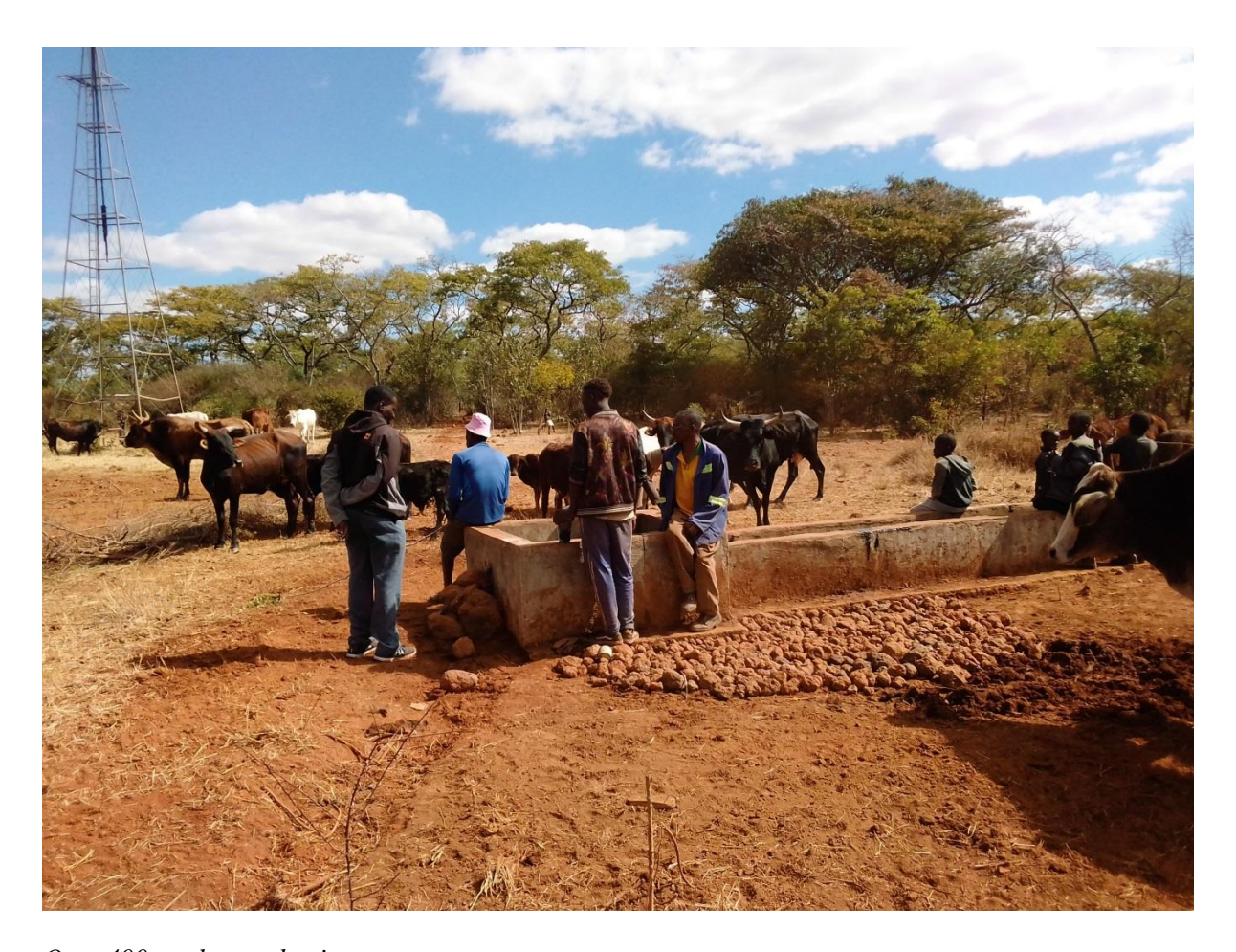
Over 400 cattle now having access to water